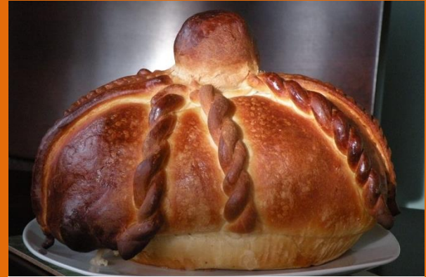
Wrapped Baked Ham

And to top off a great meal, a St. Honoure carrot cake or pie(s).